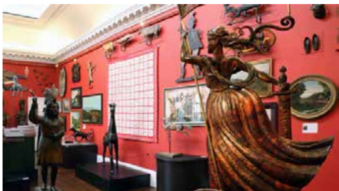
The original folk art quilt: The American Museum, Bath